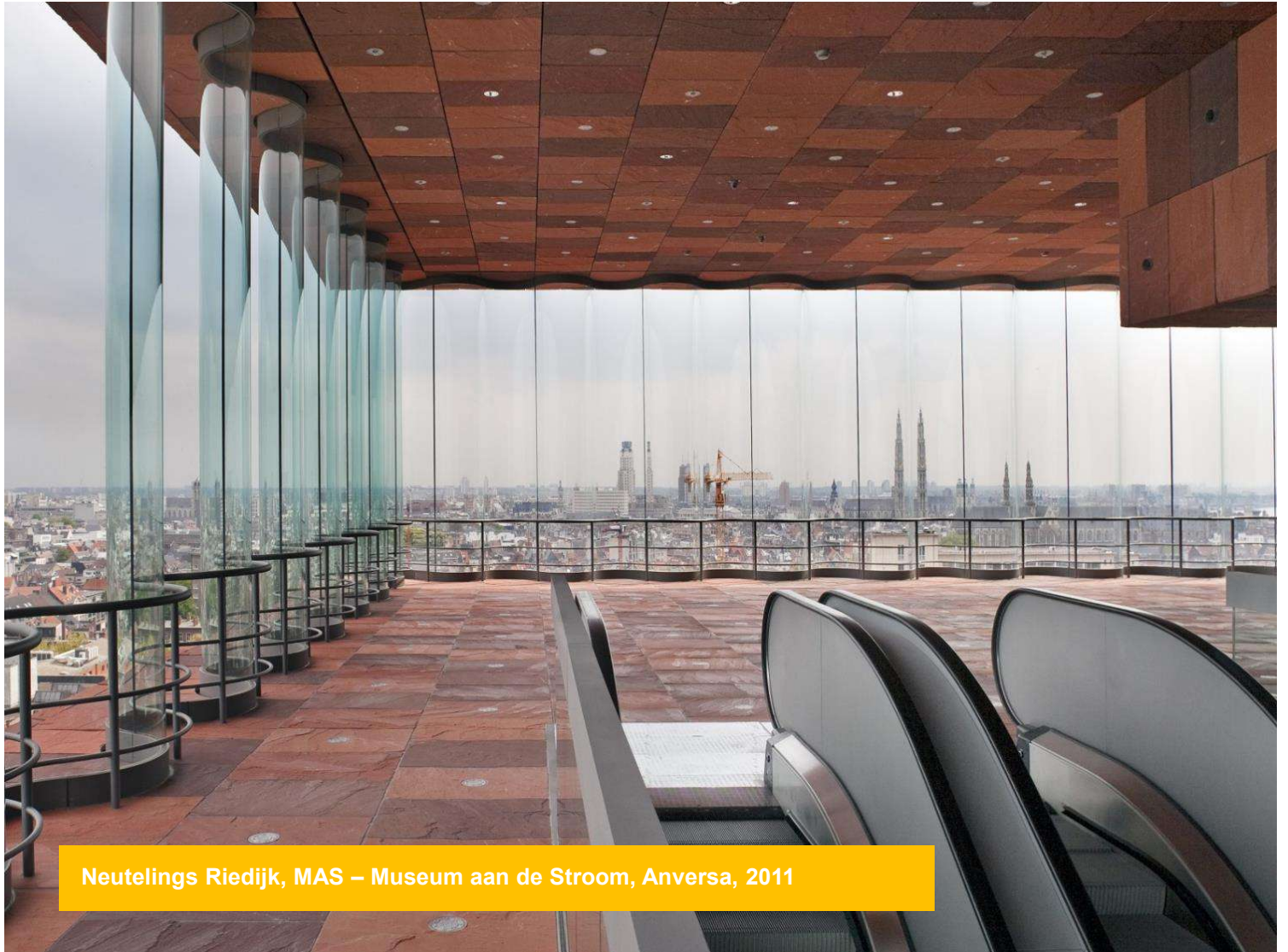
Neutelings Riedijk, MAS – Museum aan de Stroom, Antwerpen, 2011