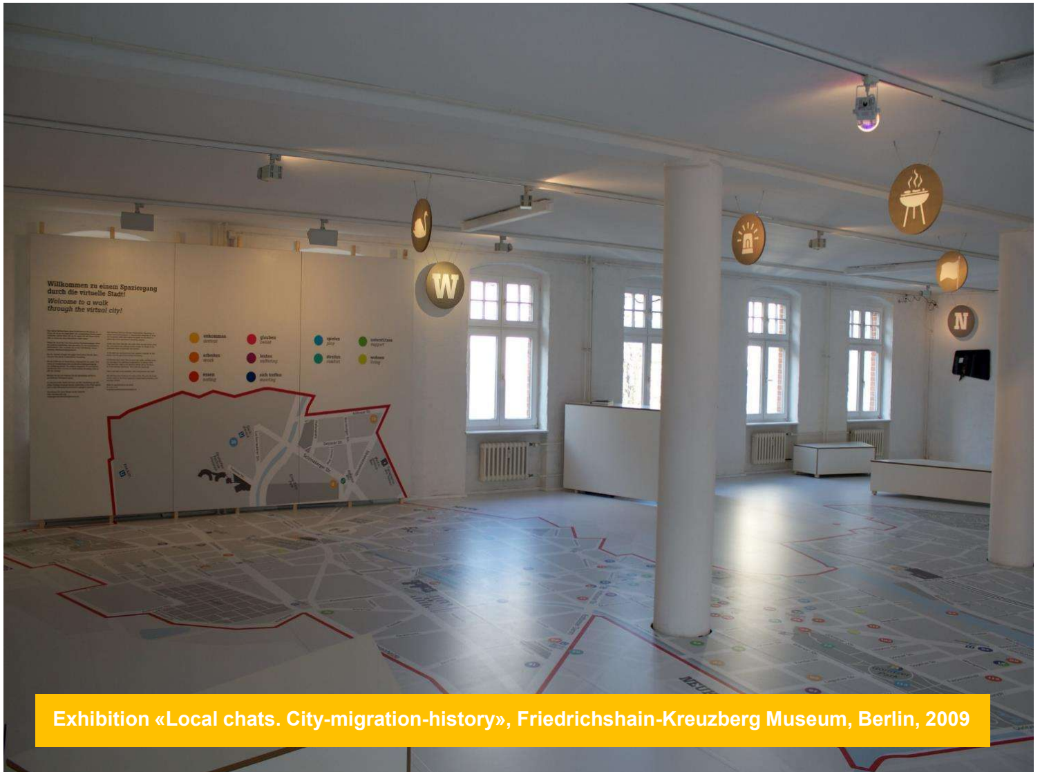
Exhibition «Local chats. City-migration-history», Friedrichshain-Kreuzberg Museum, Berlin, 2009