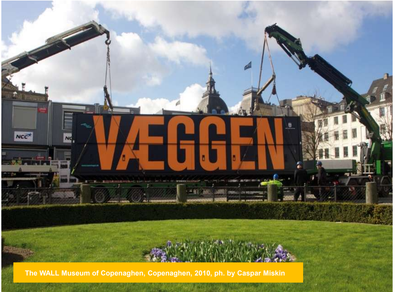
The WALL Museum of Copenhagen, Copenhagen, 2010