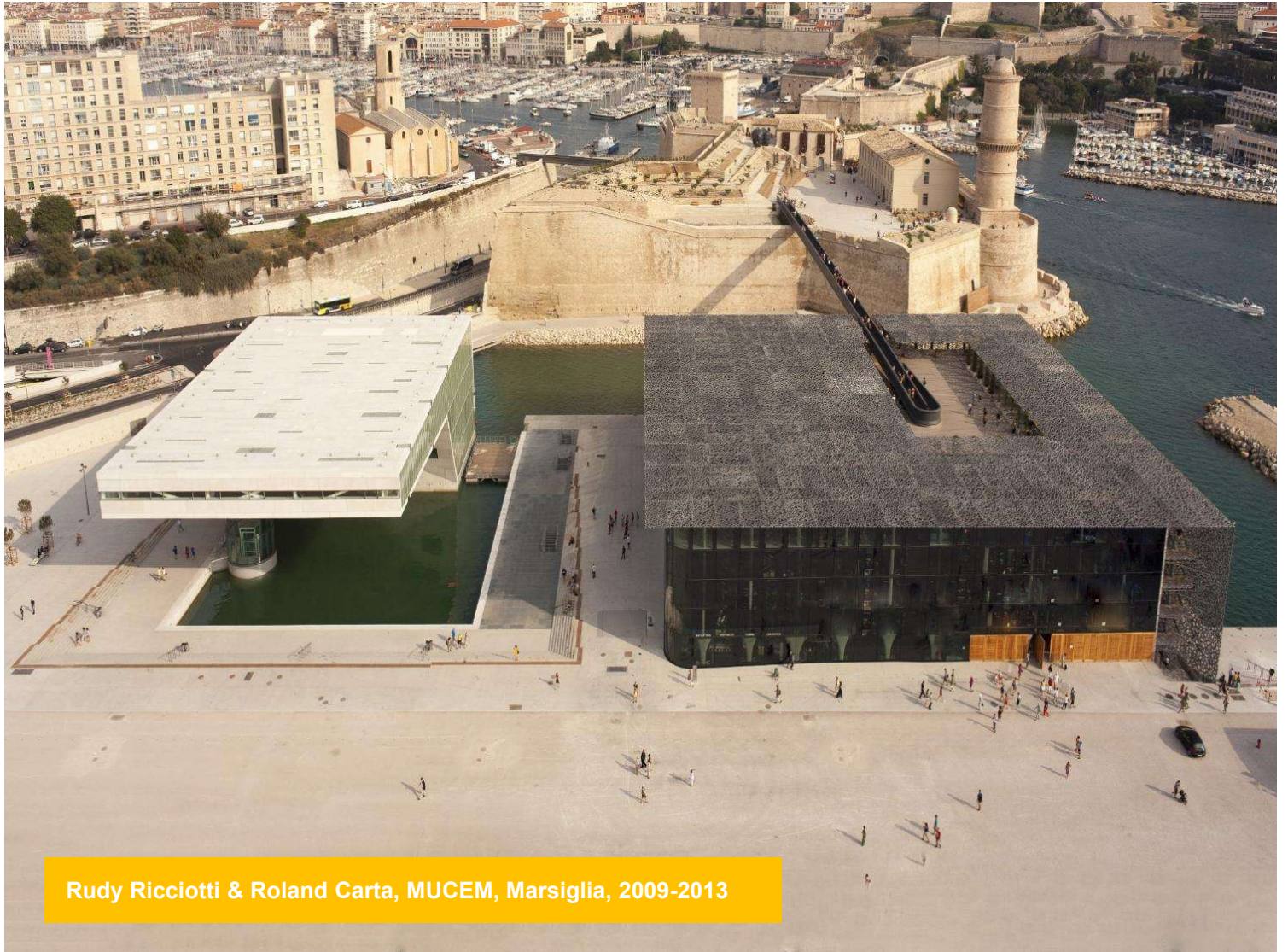
Rudy Ricciotti & Roland Carta, MUSEM, Marseille, 2009-2013