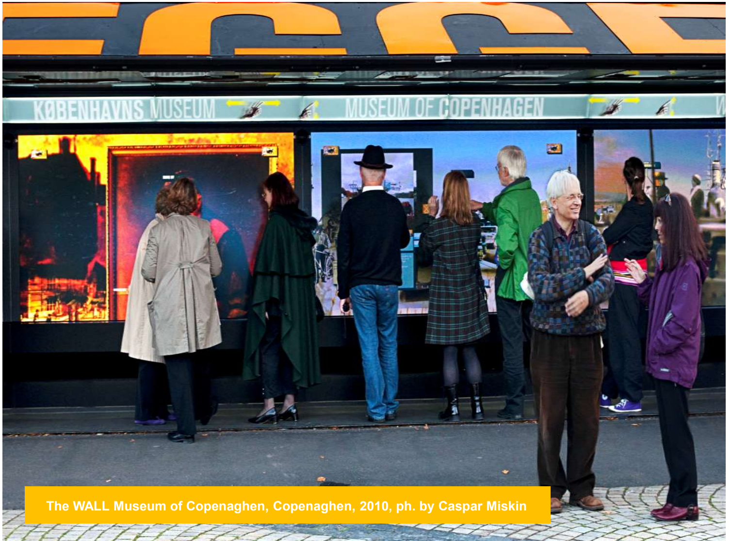
The WALL Museum of Copenhagen, Copenhagen, 2010