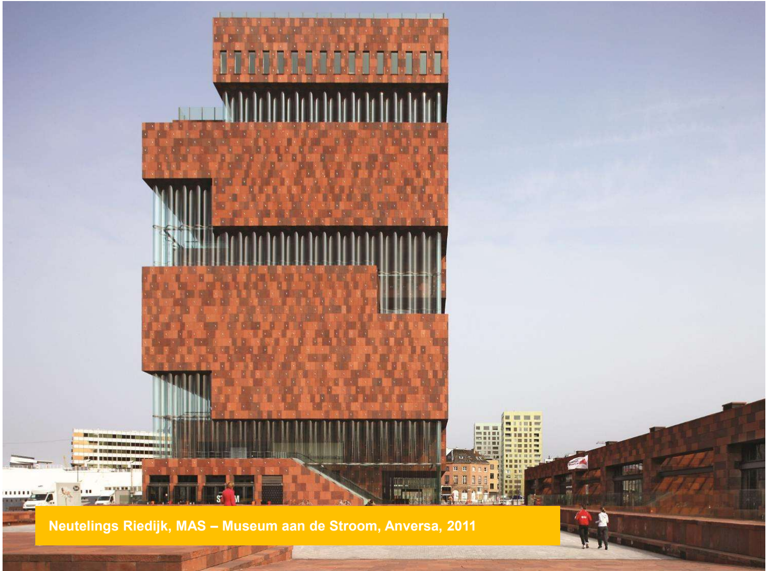
Neutelings Riedijk, MAS – Museum aan de Stroom, Antwerpen, 2011