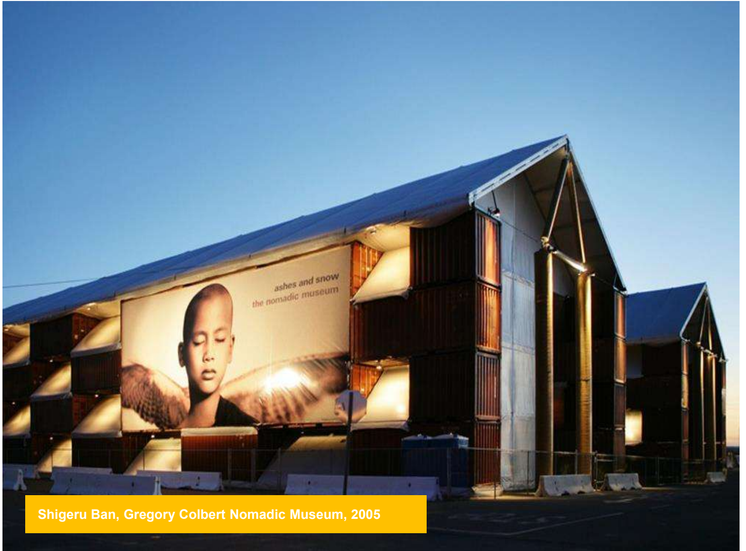
Shigeru Ban, Gregory Colbert Nomadic Museum, 2005