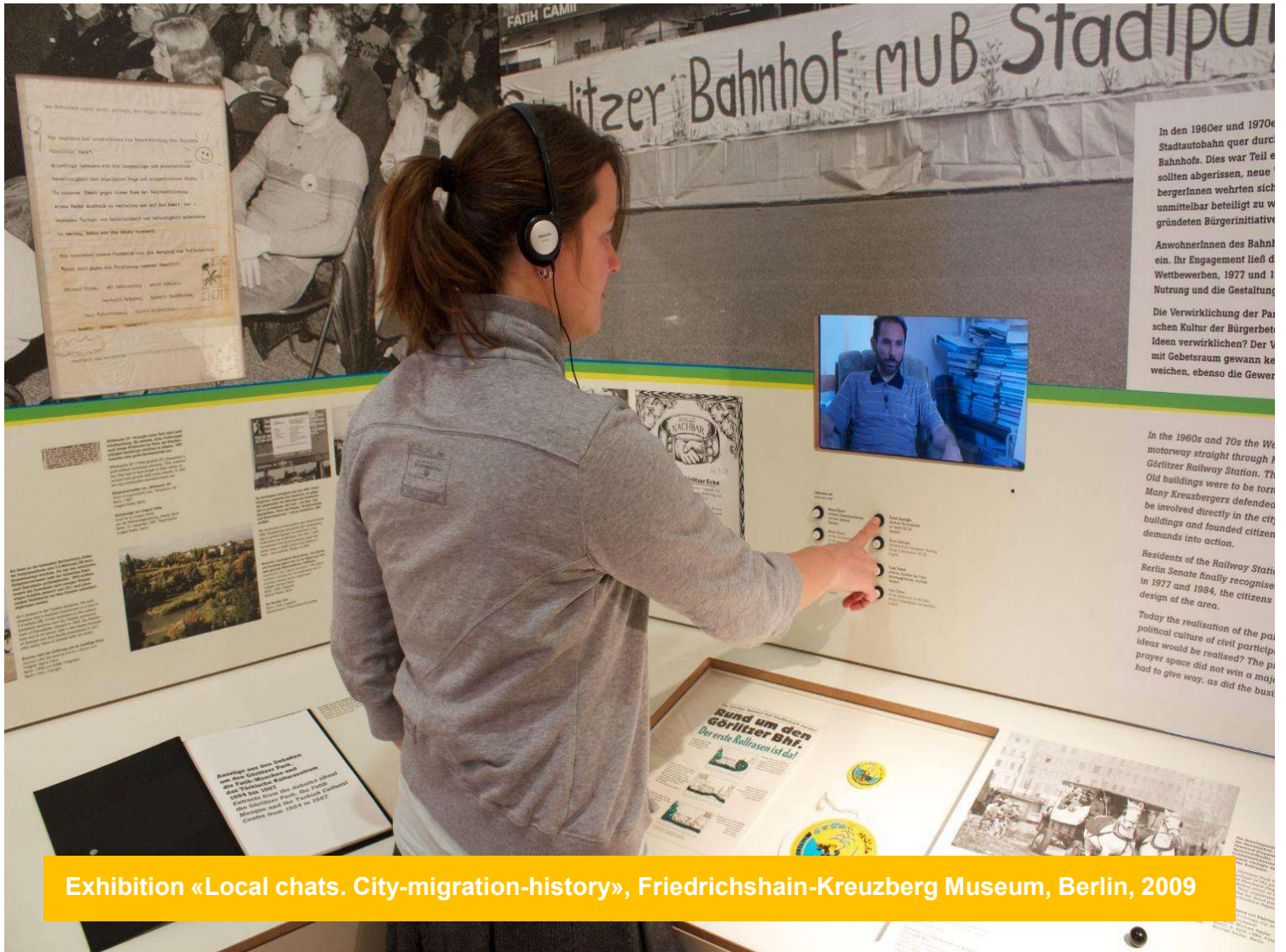
Exhibition «Local chats. City-migration-history», Friedrichshain-Kreuzberg Museum, Berlin, 2009