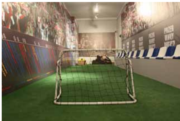
The stadium - Educational Room