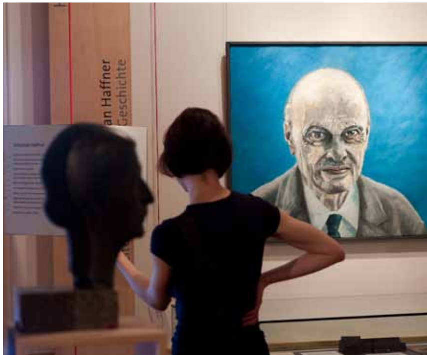
BERLINmakers ‘n’ shakers