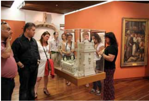
Lisbon City Museum visit.

Portuguese city museums in Almada, Aveiro, and Coimbra. The audience included about 140 persons, most of them museum professionals, others representing the fields of tourism, architecture, and design.