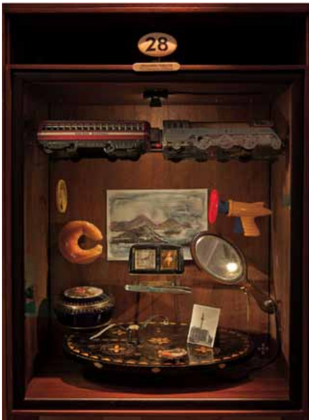
"The Consolation of Objects"