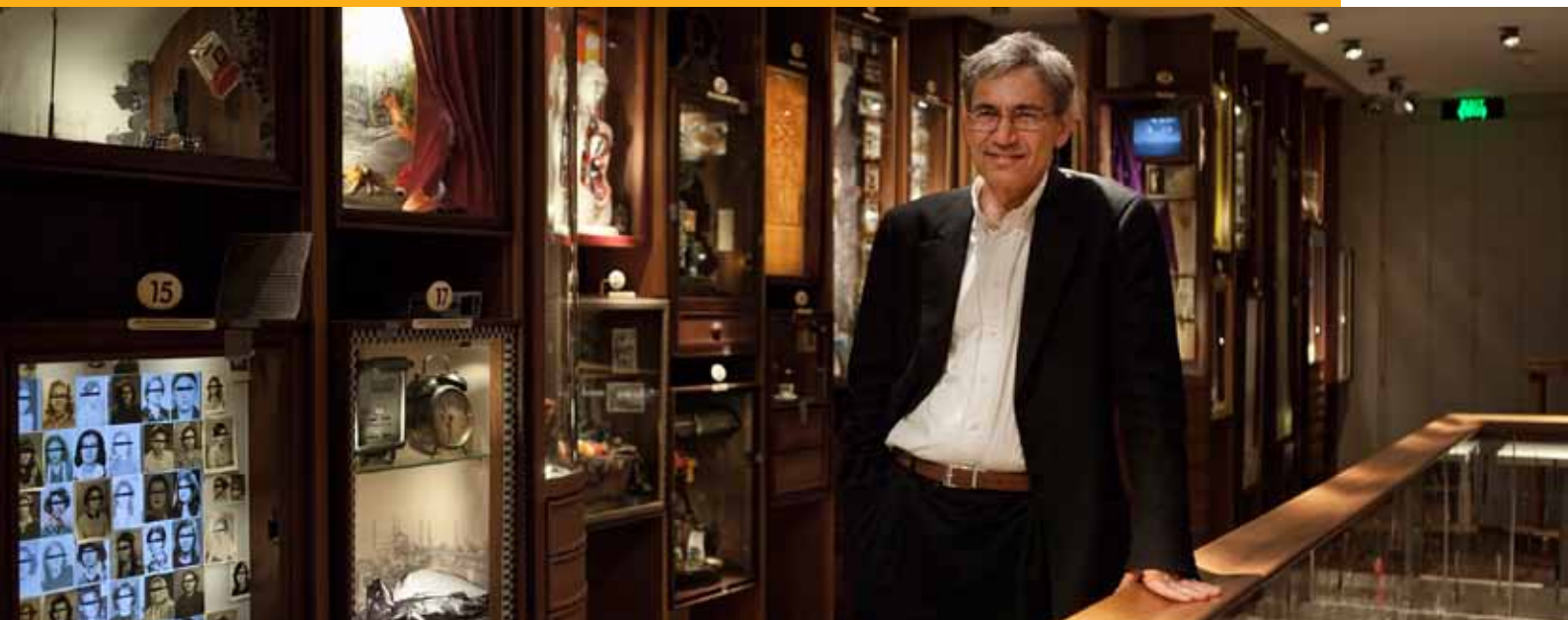
Orhan Pamuk and his museum.