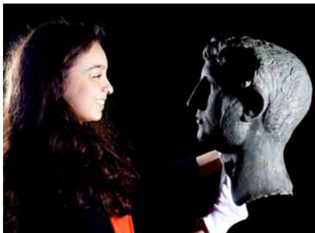
A participant from Junction Youth Panel holds a replica bust of Hadrian as featured in Our Londinium 2012

It has been important for the Museum of London to be part of the Olympic celebrations. On 26 July, the day before the opening of the games, we were lucky enough to have the torch relay visit the Museum, an occasion we marked with a party for our patrons and with acquisitions to our collection. A week later, the Museum—which enjoys a close relationship with Poland—hosted an important international event for the Polish National Olympic Committee. Nor were these the only examples of the Museum of London's global outlook during the Olympics. The Museum of London Docklands welcomed the German National Olympic Team with a hospitality base known as Deutsches Haus . The site hosted a two-week-long Fan Fest for people who wanted to find out more about German sport and culture. Meanwhile, the Terrace Rooms at the Museum's London Wall site served as the base of the World Union of Olympic Cities' (WUOC) first-ever Olympic house. The WUOC's interest in cities and the Olympic legacy offered a perfect fit with the Museum of London's own concerns. →