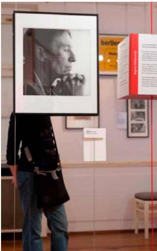
BERLINmakers ‘n’ shakers