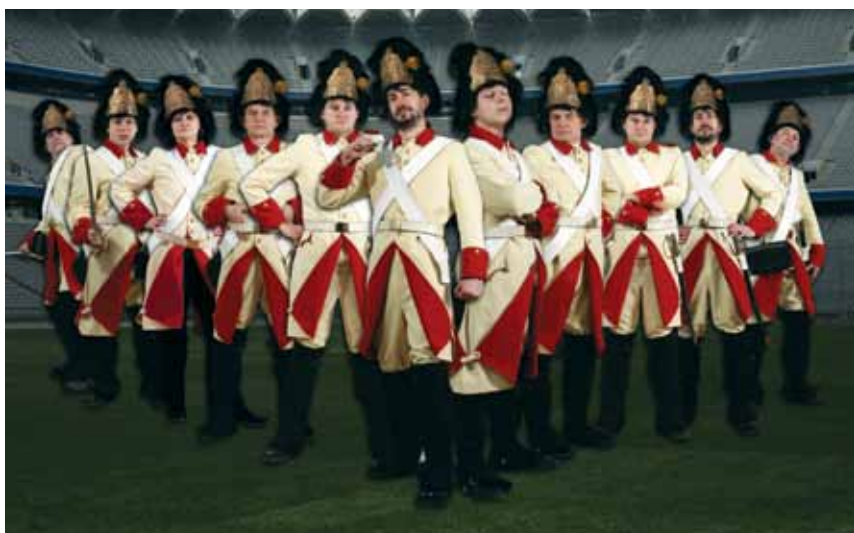
Sport teams - Part of exhibition "An Interrupted Match" connected with football foes.

when Poles who had fought by his side lost all hope of quickly regaining their independence. In 1815, the difficult "match for freedom" was interrupted, but not lost. The result was only decided in "overtime," which for the Poles was not completed until World War I.