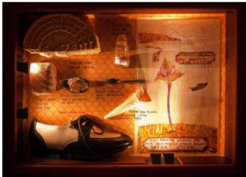
"Happiness Means Being Close to the One You Love, That's All"

Just as the novel grew from the original collection, the museum exhibition is structured according to the story. Items used, worn, heard, collected, or imagined by the characters in the book's 83 chapters—some of them authentic, others reproductions produced by the museum's creative team—are displayed in 83 different boxes in the museum. Visitors are welcomed at the entrance by a "wall of cigarettes": 4213 cigarette butts smoked by Füsün and collected by Kemal, each one →