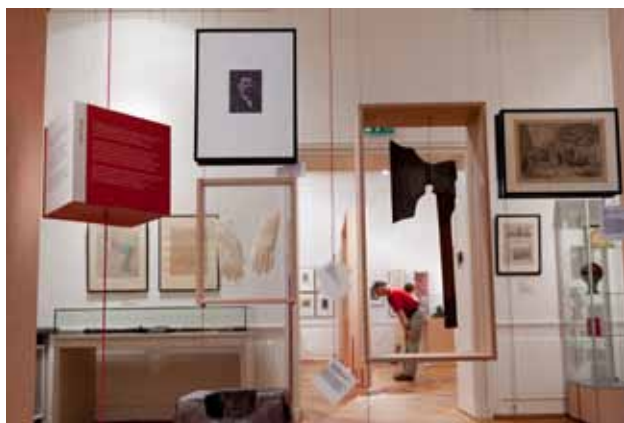
BERLINmakers 'n' shakers Stadtmuseum Berlin

The exhibition's design connects not only the historical figures within each segment, but also the segments themselves, through the individual relationships of the protagonists on display. In 1872, for example, railway magnate Strousberg acquired the painting "Women Plucking Geese" by Max Liebermann. In 1927, Liebermann received a letter from Berlin's Mayor, Gustav Boess, awarding him honorary citizenship. Ostracized under the Nazi regime a short time later, Liebermann died in 1935. Only a small number of friends and relatives followed his coffin to the Jewish →