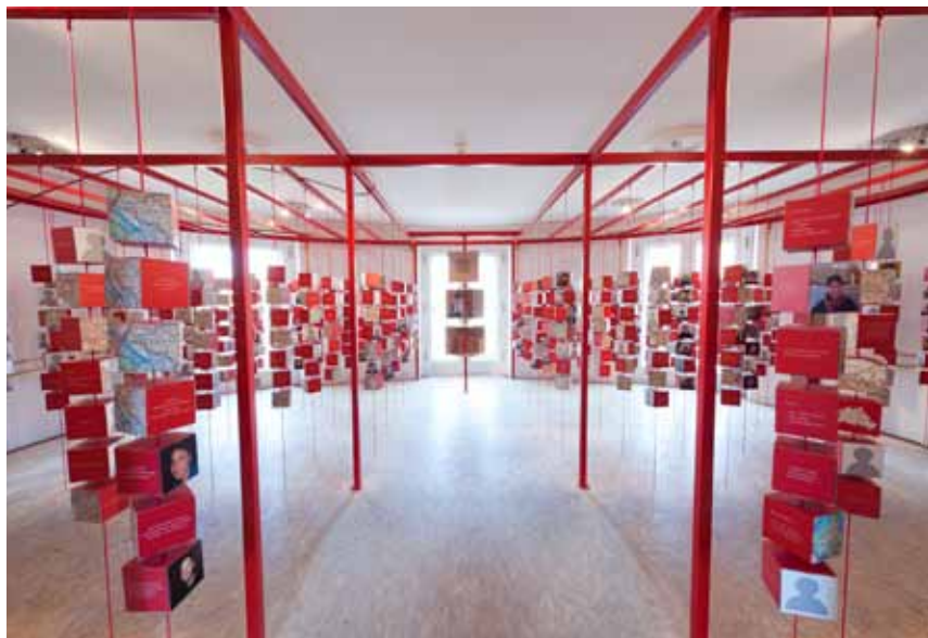
BERLINmakers 'n' shakers

The central theme of BERLINmakers 'n' shakers is not historical events, but rather the individual life stories of