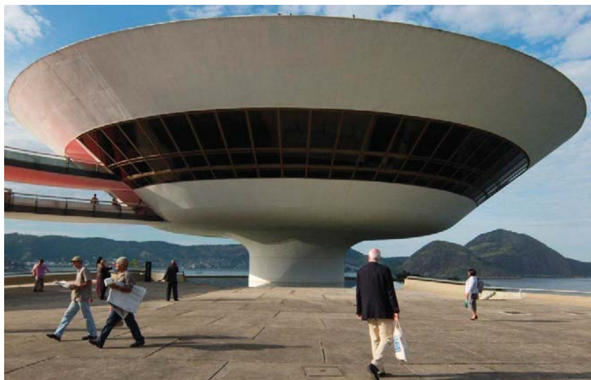
Contemporary Art Museum, Niterói