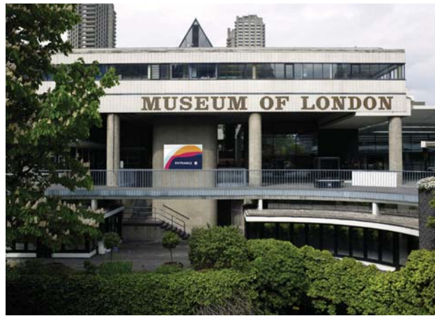
Museum of London rotunda view