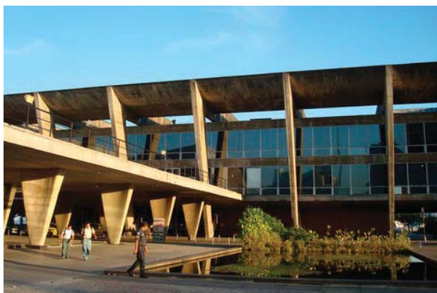
Rio Modern Art Museum

Such museums can preserve important cultural meanings. The Museum do Mamulengo in Olinda (a former Brazilian capital and World Heritage site) is devoted to a popular tradition of travelling puppet shows from north-eastern Brazil. It displays the traces of puppetry with a rich array of often satirical, sometimes scary figures propped up for visitors to see. But it is very much a living place, where aspects of making and performing can be seen, →