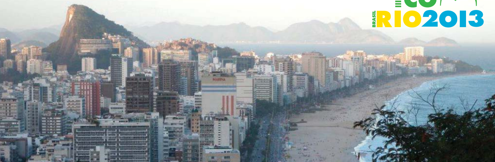
View of Rio from the area currently planned for the City Museum