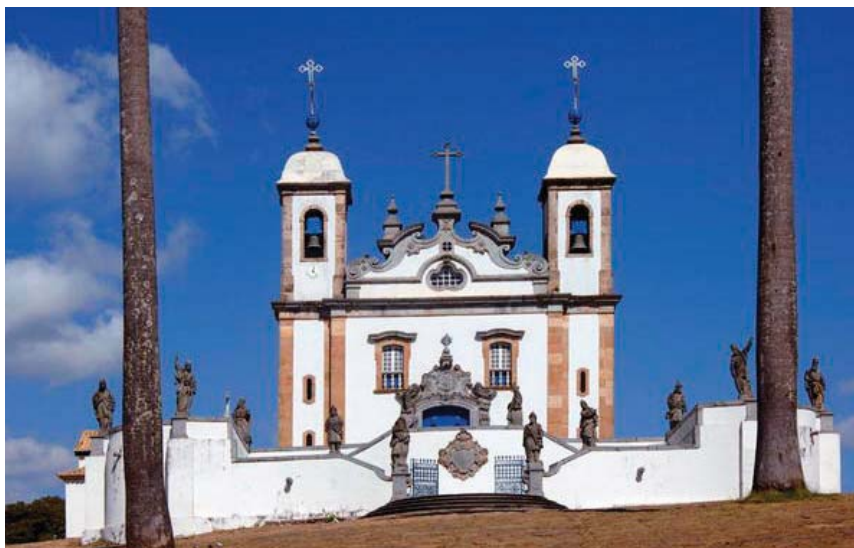
Senhor Bom Jesus do Congonhas

Extending the boundaries of cultural perception is a key function of city museums. Retrieving what was lost, revaluing what was once overlooked, giving voice to the silenced are all important uses of the past that enrich the future. In particular, as we move into an age of virtual chat and digital identities, we see increasingly that museums