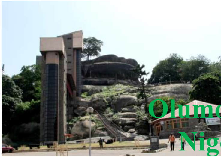
Olumo Rock Nigeria