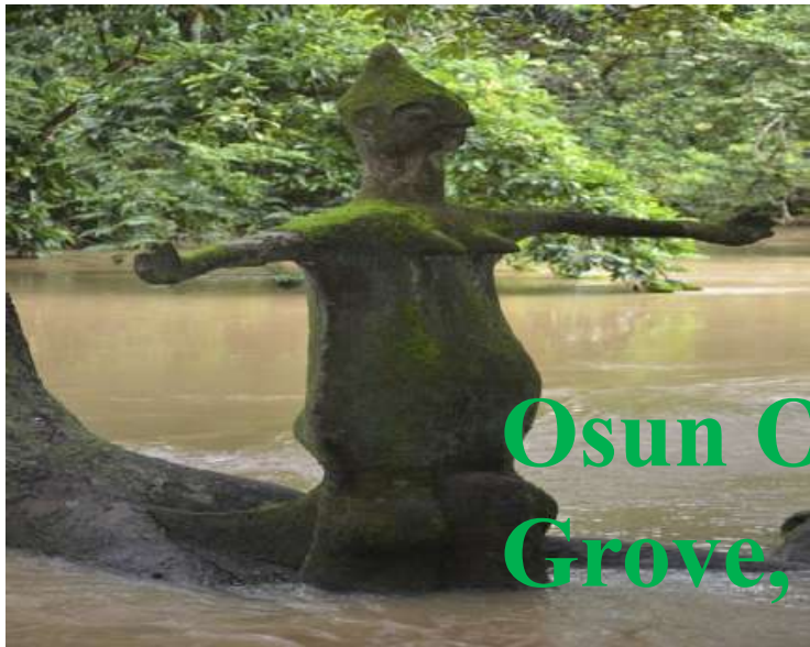
Osun Oshogbo Grove, Nigeria