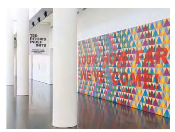
'Undefined Territories: Perspectives on Colonial Legacies', exhibition views, 2019.