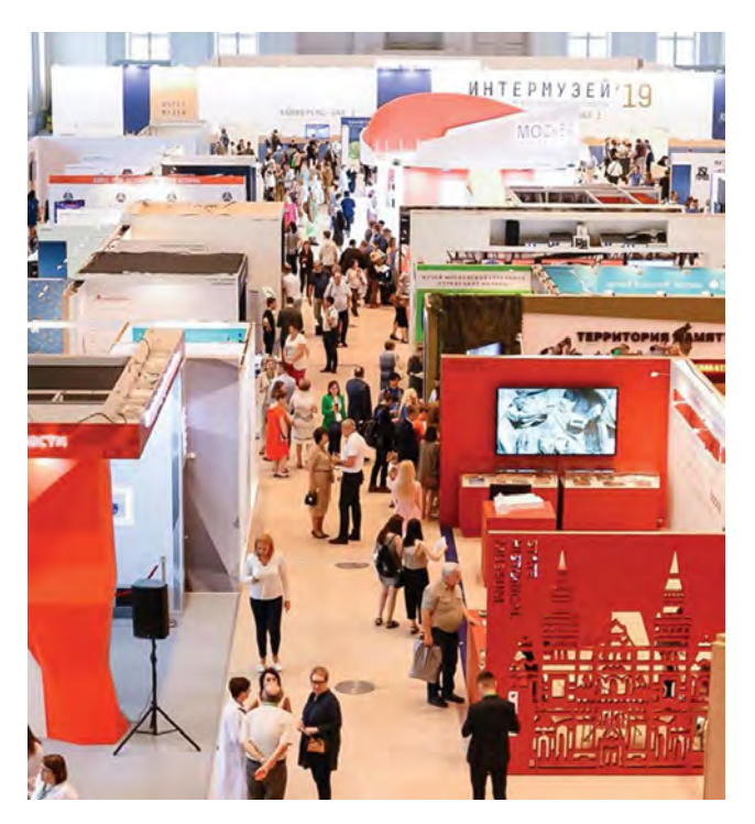
The InterMuseum Festival in Moscow.

curator, Museum of Rotterdam), and myself (CAMOC / Museum of Lisbon).