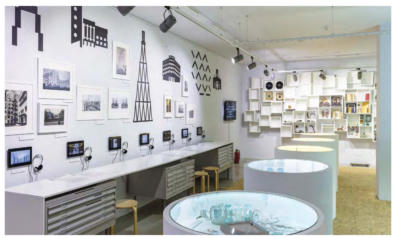
The permanent exhibition at the Museum of Avant-garde.