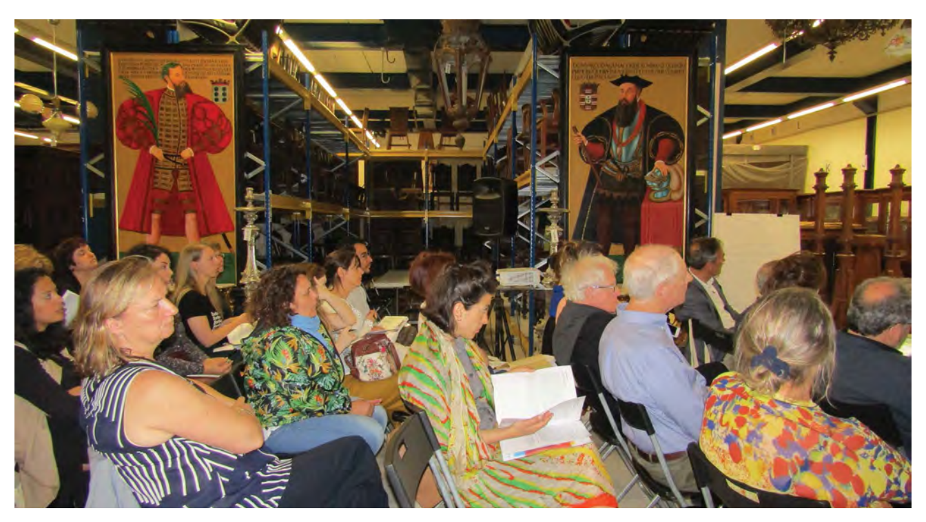
At the central storage of the museum.

Museum of Lisbon, Lisbon, Portugal May 3-4, 2019