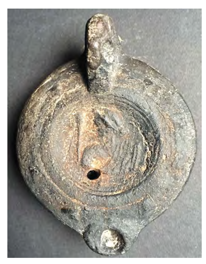
Image 2: Oil lamp depicting Dionysus, of Egyptian production, from the necropolis of Angera. IInd-IIIrd century AD.

"The object belonged to a 45-year-old freed slave named Caria, who suffered from insomnia. She liked being alone at night, watching the shadows created by this oil lamp. She believed the little flame awakened the spirits