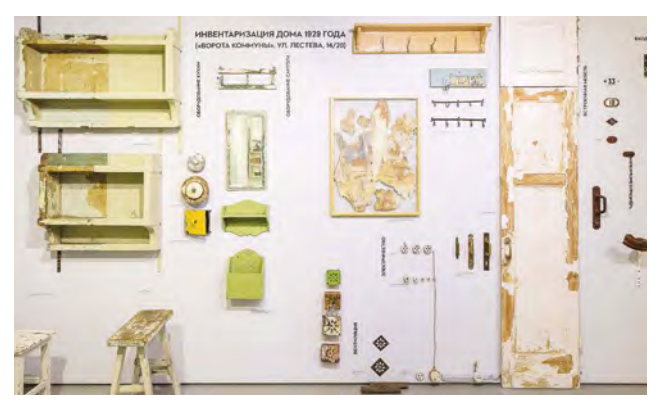
The permanent exhibition at the Museum of Avant-garde.

Currently, the legacy is in a deplorable state: many buildings of the 1920-1930s are demolished or being rebuilt beyond recognition. The only way to preserve them and change the attitude of city authorities and residents towards them is to popularize this heritage – lectures, exhibitions, excursions. Educational and exhibiting activities of the Avant-garde Centre are aimed precisely at creating such a "constructivist cluster" in Moscow, which could become a model for other regions and cities.