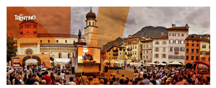
Trento Festival of Economics.