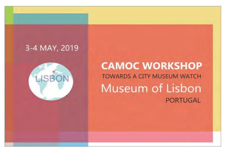
CAMOC Workshop poster.

by the communities and archived with the communities. Notably, the easy production and free dissemination of video pave the way for a challenge in terms of collecting, curating, storing, and providing access to the enormous amount of data. Today, autonomous archives document, preserve and present the counter-image of the state archives by working as collectives. Based upon the idea of "archiving now collectively" and the question of "too much material", I concluded my talk by asking the audience about the possible collaboration between city museums and autonomous archives, concerning ICOM's ongoing project of the new museum definition.