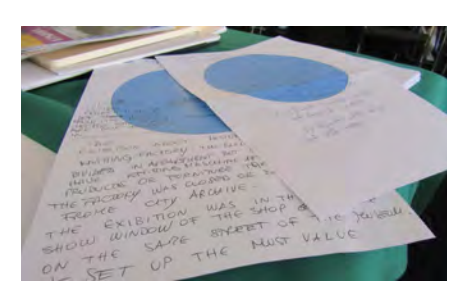
A detail from one of the interactive sessions