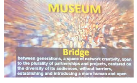
From the keynote presentation on the new museum definition