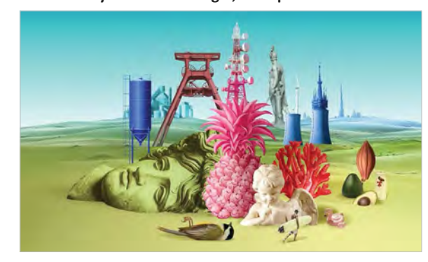
© Międzynarodowe Centrum Kultury w Krakowie's post in 5th Heritage Forum of Central Europe | Heritage and Environment

In light of the above, the aim of the fifth edition of the Heritage Forum of Central Europe, to be held on 19-20 September 2019 at the International Cultural Centre in Krakow, is to discuss and analyse the links and mutual dependencies between heritage, those "meaningful pasts that should be remembered" (Sharon Macdonald), and environment, both material and socio-cultural. While investigating the relationship between the two, special consideration is to be given to an attempt to transgress and challenge various dichotomies that have traditionally shaped our way of thinking about heritage and environment and their antithetical rapport (nature/culture, permanence/transience, tangible/intangible, etc.). By means of addressing such issues as, for example, the impact of environment on memory and identity, natural and/or cultural heritage, historic environment(s), biodiversity and conservation, the Forum's objective is to demonstrate that the relations between heritage and