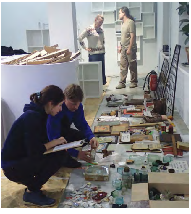
Preparations for an exhibition at the Museum of Avant-garde.

For many years, the residents of the district dreamed of creating a museum of local lore dedicated to the history of this place. The exhibitions Topography of Happiness and Model for a New Life on a 1: 1 Scale , as well as materials, documents, testimonies, objects from the personal archive and recorded interviews of tenants, made it possible to tell the realities of Soviet utopia and its transformation throughout the 20<sup>th</sup> century, through personal experiences.