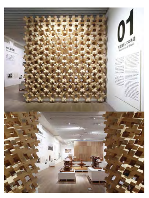
Top: No.1 Kitagawara Atsushi KIGUMI INFINITY. Bottom: Japan in Architecture: Genealogies of Its Transformation".

Structured around nine sections based on key concepts for interpreting architecture in Japan today, this exhibition traces the lineage of architecture from ancient times until the present, and explores the elements of genealogy undermined by modernism and concealed beneath, yet undeniably vital still. Featuring 100 projects and over 400 items that include important architectural