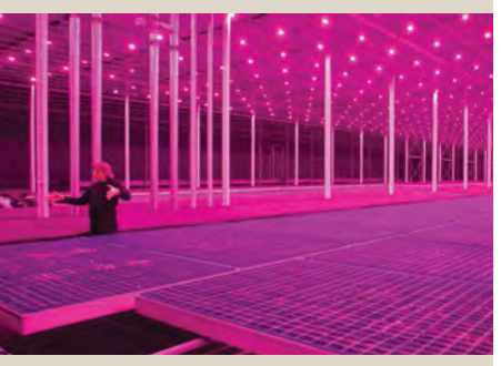
Rem Koolhaas, "Countryside: Future of the World - Pink Farm". © The Solomon R. Guggenheim Museum