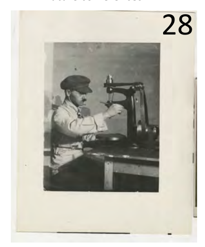
Gastev. How to Work

Upcoming exhibitions 34 CONFERENCE ALERT Future conferences